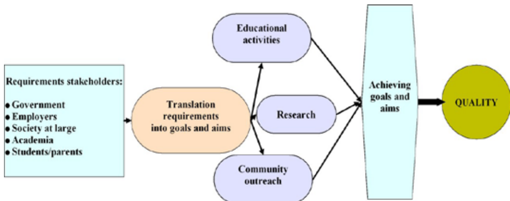
Figure 1: Quality as an object of negotiation between the relevant stakeholders in higher education.

The relationship between stakeholders’ requirements and achievement of quality in higher education can be represented in schematic diagram as shown in figure 1: