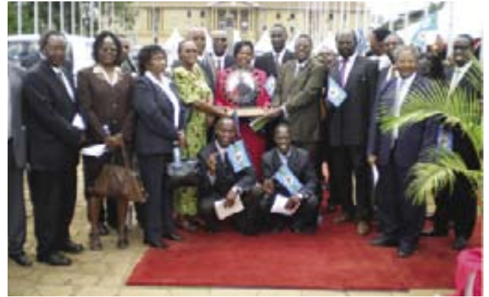
Senior Management Staff and students of Kenyatta University pose for a group Photograph after receiving the coveted Performance Contract Winner's Trophy from the President.