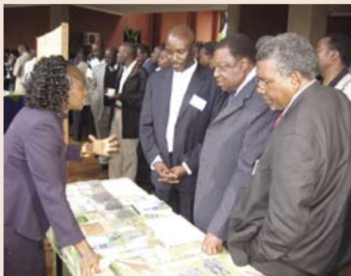
VicRes Annual Forum Exhibition May 2008

On Land and Natural Resources, the paper mentioned several ways in which innovations in the