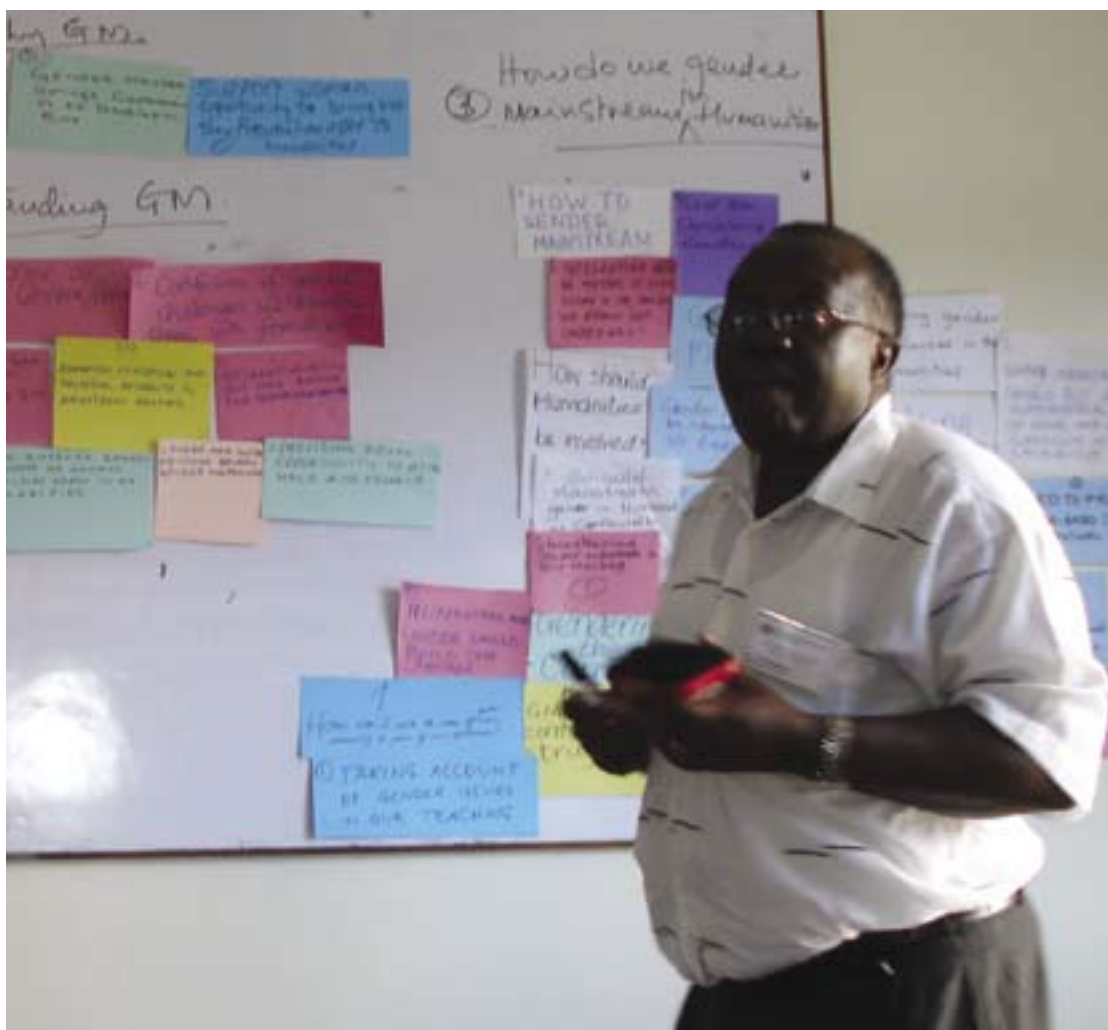
Arts/Humanities Cluster Workshop Sept. 2008

The workshop was one of the series of subject area meetings that will be held from time to time with interdisciplinary focus.