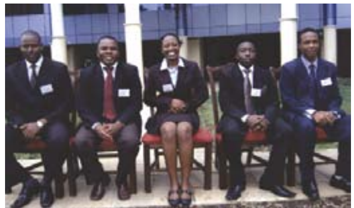
Among the students Leaders who attended the World Bank Workshop June 2008, Arusha, Tanzania