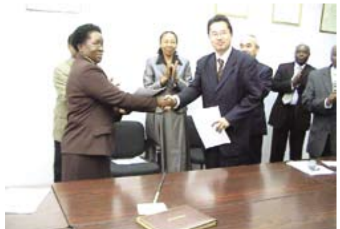
JKUAT MoU with Nissin Co. Ltd

The writer is the University’s Public Relations Officer