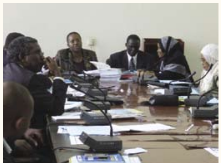
Discussion on the IUCEA BILL in Uganda August, 2008

Each party concerned gave input to the draft Bill. The proposed amendments will be presented to the relevant organ for further consideration.