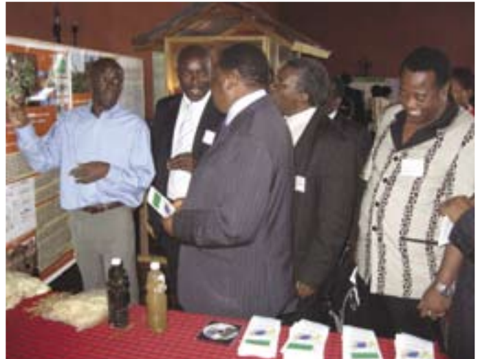
VicRes Annual Forum Participants admiring the Exhibition, May 2008, Ngurdoto M. Arusha