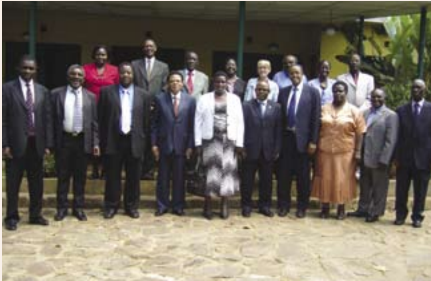
17 th IUCEA Executive Committee Meeting, 23 rd June 2008 Kigali, Rwanda

I also realize that there is a global debate today