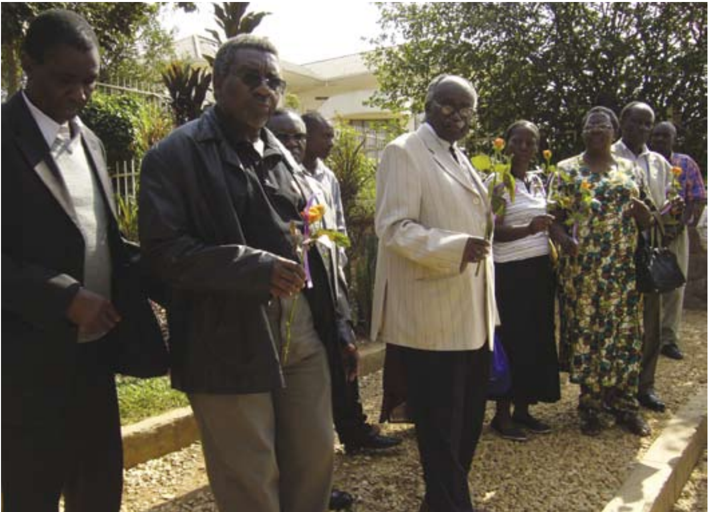
IUCEA Executive Committee members when they visited the Genocide Memorial site in Rwanda, June 2008

Stefano Moshi Memorial University College www.smmuco.ac.tz