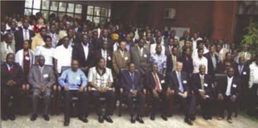
VicRes 5 th Annual Forum Participants May 2008, in Arusha abundant natural capital, solar energy.”

• The Norway example: Instead of spending the money directly, most of Norway’s revenue from sales of oil goes into an investment fund known as the Petroleum Fund, which is currently valued at USD 131 billion. The fund is in turn invested in stocks and other assets around the world. It is the income generated from the secondary investments that is used within Norway. This strategy explains why the discovery of oil has not destroyed the Norwegian aquaculture industry the way oil destroyed agriculture in Nigeria. However, the most significant aspect of this strategy is that the oil wealth is held in perpetuity and will continue to generate income even if Norway runs out of oil resources.