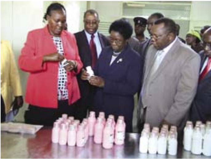
JKUAT Service Charter Launch

2030. She commended the institution in the progress it had made in boosting the country's industrialization programme despite its financial constraints.