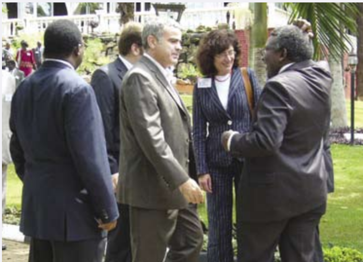
QA Workshop Participants in July 2008-Entebbe

He proposes that the more East Africa participates actively in the globalization and considers itself no longer as a victim of globalization, the more internationally recognized quality standards become fundamental in many fields, including the higher education sector," concludes the Ambassador, by saying that those are some of the reasons why German supports the efforts to set high and comparable academic standards in the East African universities, to set identifiable quality benchmarks for East Africa.