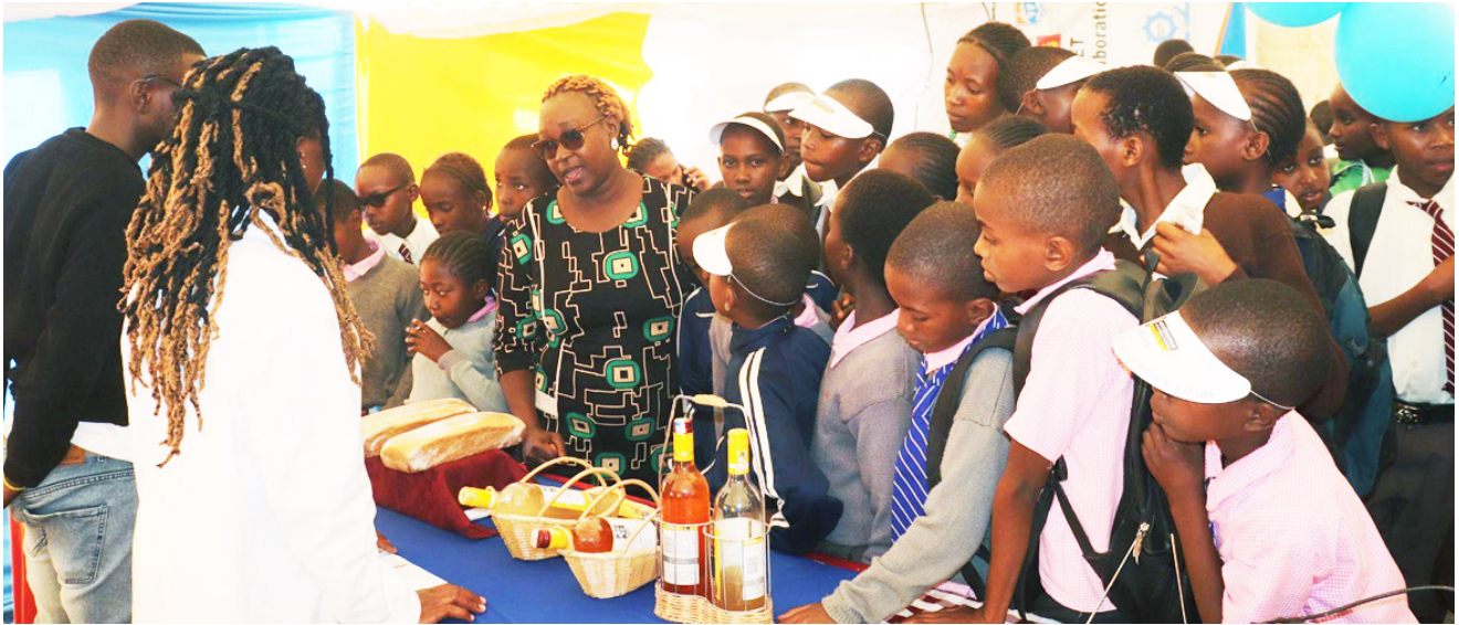
Students during the innovation exhibition at Meru National Polytechnic

Students at Meru National Polytechnic's Electrical Department have developed a robot that is poised to improve the way dairy farming is practiced in Kenya, making it more efficient and sustainable.