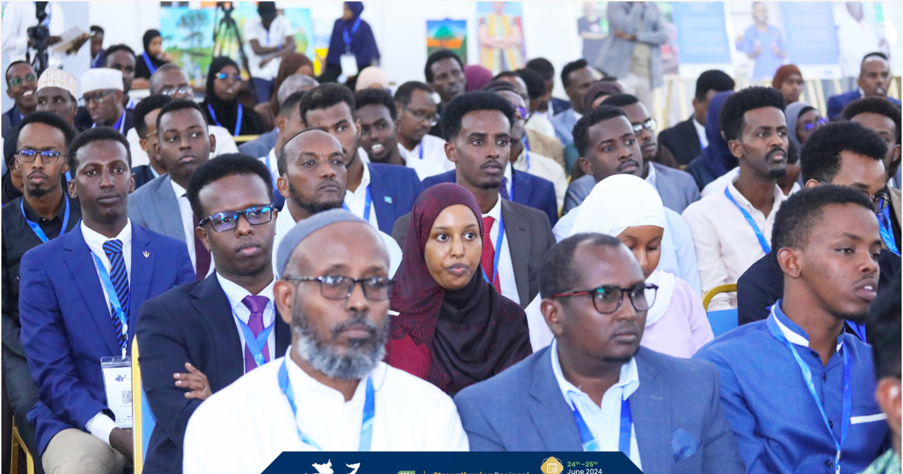
Participants from different universities in Somalia at EAC conference in Mogadishu

Following the entry of the Republic of Somalia into the East African Community (EAC), the Inter-University Council for East Africa (IUCEA) together with SIMAD University in Somalia and other partners co-organised the EAC Conference (EACON 2024). IUCEA participation at the conference was to champion the integration of Somali institutions into the EAC Common Higher Education Area.