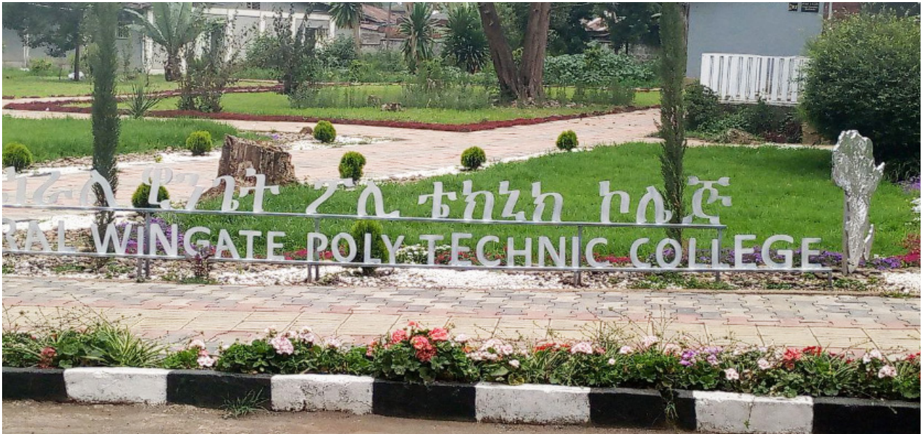
Some of the greening initiatives at Gen Wingate Polytechnic College

General Wingate Polytechnic College has taken steps towards creating a more environmentally friendly campus through its green TVET initiatives. The College is focusing on activities such as tree planting and landscaping with grass to enhance the beauty of its surroundings and advance a culture of sustainability among its community.