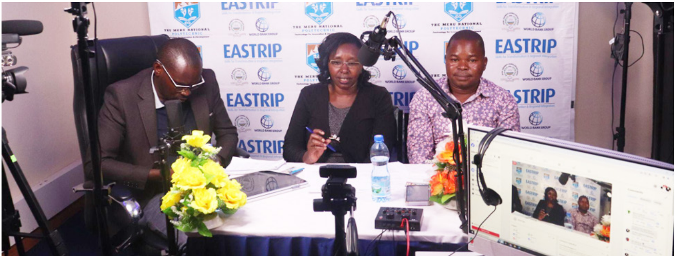
Instructors at the ODeL Centre at Meru National Polytechnic

The Meru National Polytechnic has introduced an Online Campus, named the Open Distance and eLearning Centre (ODeL Centre), that allows students to enrol in online courses and complete assessments remotely, offering flexibility to learners across the East Africa region.