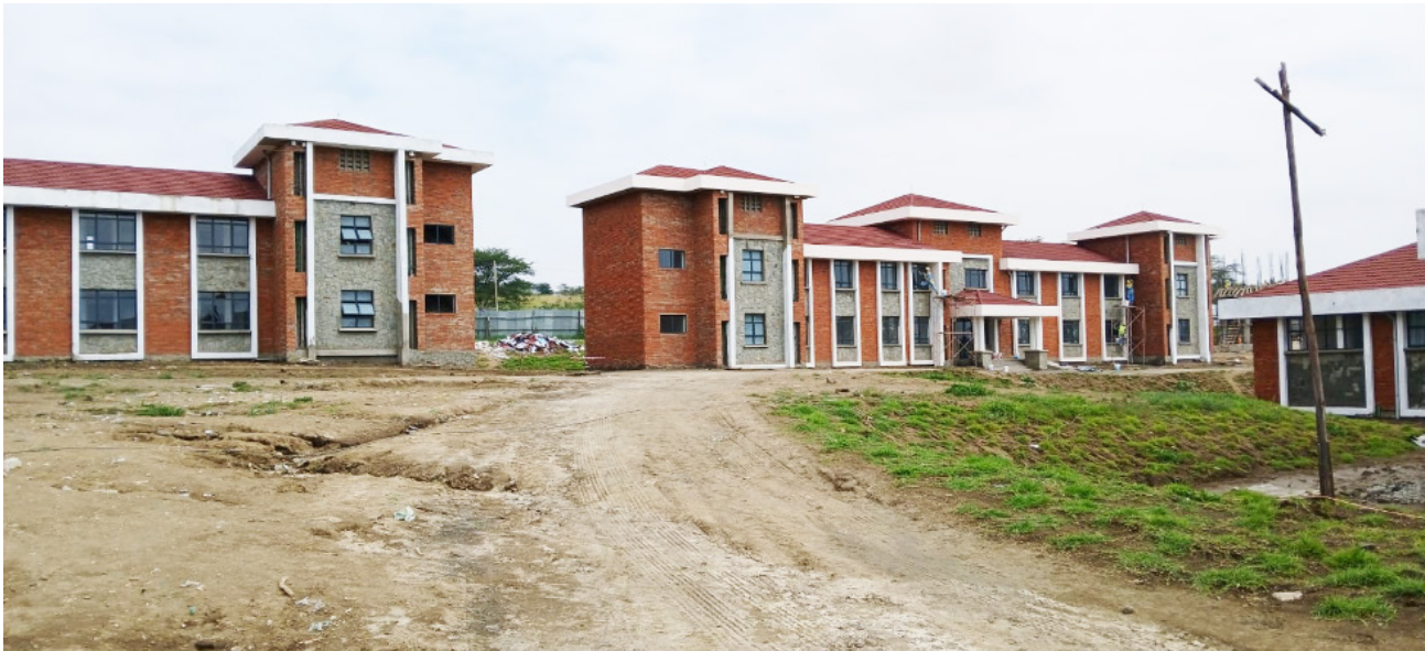
■ A cross-section of the KenGen Geothermal Training Centre currently under construction in Naivasha, Kenya.

The Kenya Electricity Generating Company (KenGen) is on the verge of completing its state-of-the-art geothermal training centre, a facility poised to become the Regional Flagship TVET Institute (RFTI) in Geothermal Training. This new centre, located near KenGen's Olkaria geothermal power plants in Naivasha, Kenya is set to enhance the region's capacity for geothermal energy development, a crucial step towards sustainable energy solutions.