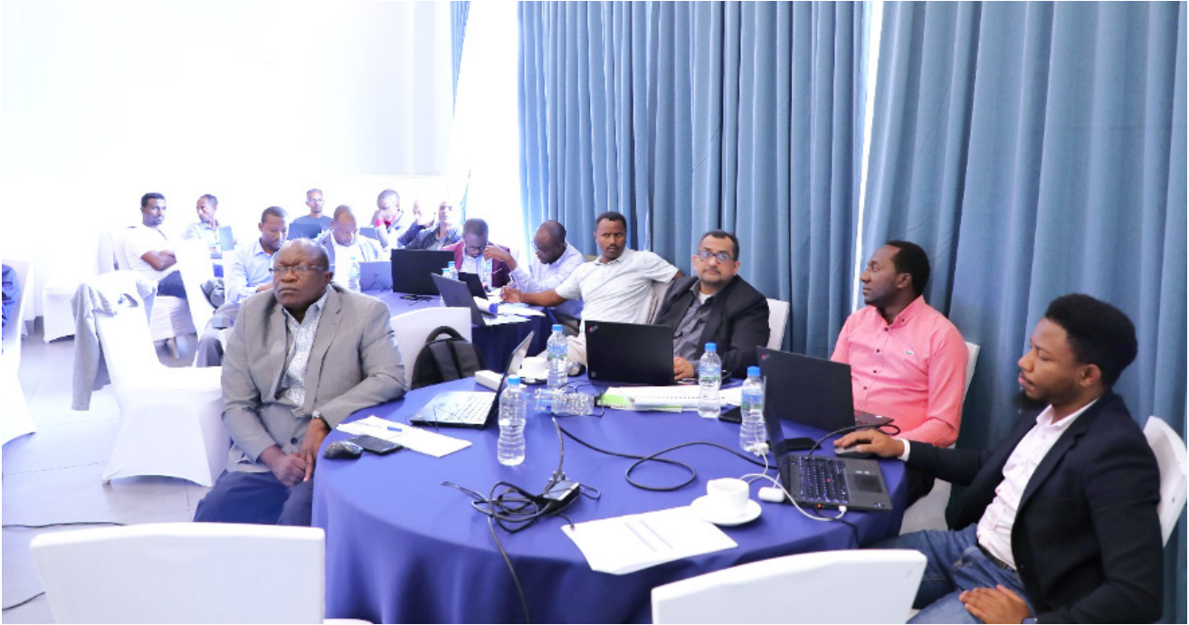
■ Participants during the training workshop in Addis Ababa, Ethiopia

The Inter-University Council for East Africa (IUCEA), the Regional Facilitation Unit for The East Africa Skills for Transformation and Regional Integration Project (EASTRIP) held a capacity-building workshop in preparation for the 5th round independent verification of EASTRIP results. The training, held in Addis Ababa from August 1st to 3rd, was facilitated by PriceWater Coopers (PwC), the Independent Verification Agent (IVA) for the project. It aimed to equip participants with the necessary skills and knowledge to effectively collect and report data for the 5th round of Data on Learning