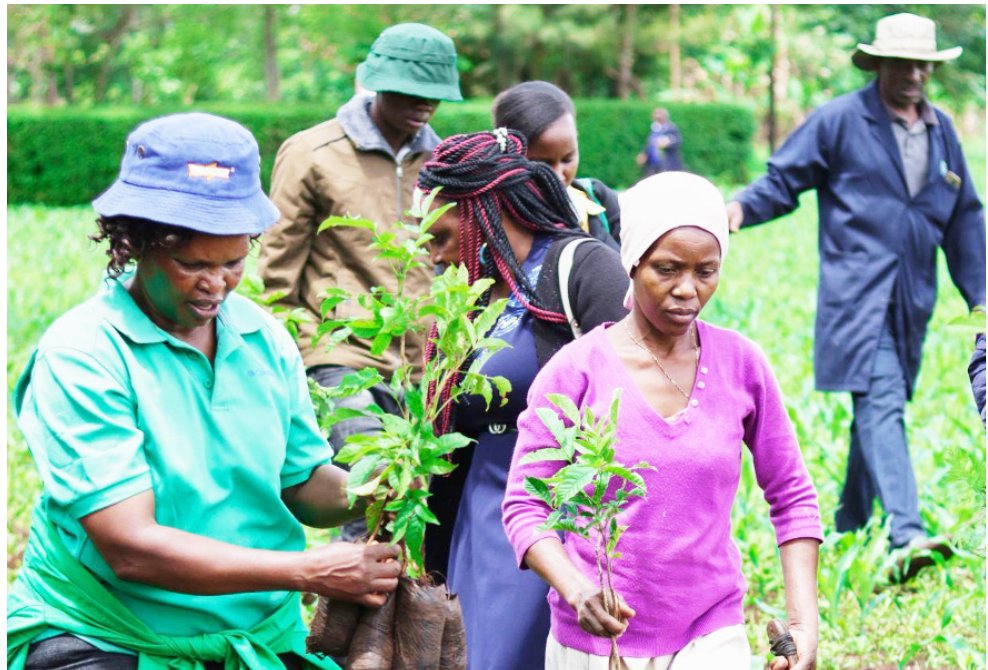
■ Instructors and students at Giaki Agricultural research and Demonstration Centre