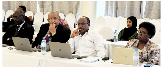
Higher education representatives from Partner states of the East African Community (EAC) at the consultative meeting in Juba on the 19th of July 2024 at Imperial Plaza, Juba-South Sudan.

The HAQAA3 will provide technical support for