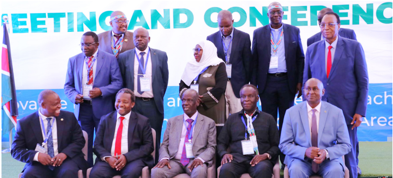
IUCEA Executive Secretary with the newly elected Executive Committee and the former Executive Committee members on the 18th of July 2024 at Imperial Plaza, Juba-South Sudan.