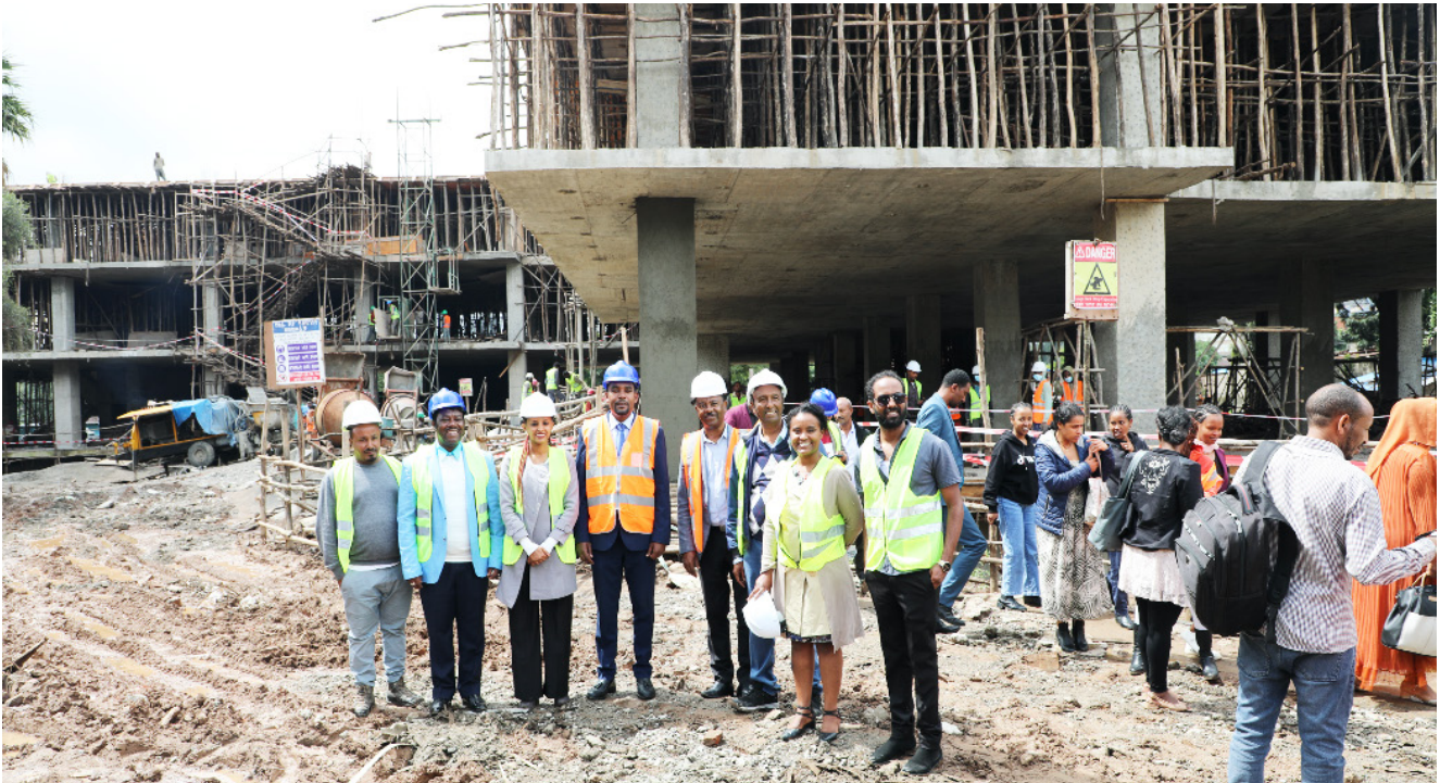
■ Dr. Teshela Berecha, State Minister for TVET in Ethiopia at the construction site for the Ethiopia Training Authority.

The Inter-University Council for East Africa (IUCEA), World Bank, and the National Project Coordination Units for the East Africa Skills for Transformation and Regional Integration Project (EASTRIP), between July and August undertook a joint monitoring and support mission in Ethiopia and Tanzania. EASTRIP is an initiative of the World Bank and African governments to enhance the quality and relevance