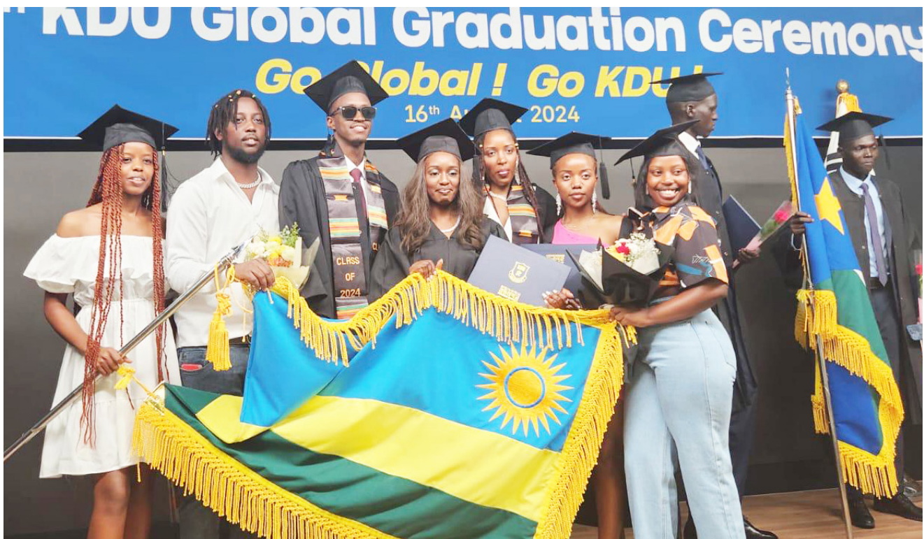
EAC students from partner states took pictorial photos during the KDU graduation ceremony on August 16, 2024

During the KDU Global graduation ceremony held on August 16th, 2024, a total of 32 outstanding students from the East African Community (EAC) nations celebrated the completion of their studies, marking an important milestone for Cohort 2 of the IUCEA-KDU Scholarship program.