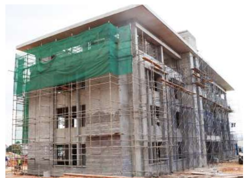
■ IUCEA Phase II ongoing Construction.

The new headquarters will serve as a focal point for promoting collaboration and cooperation among member universities, ultimately advancing education and research in the East African region.