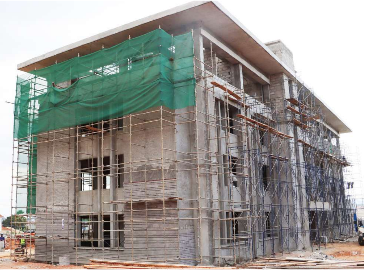
IUCEA Phase II ongoing Construction.