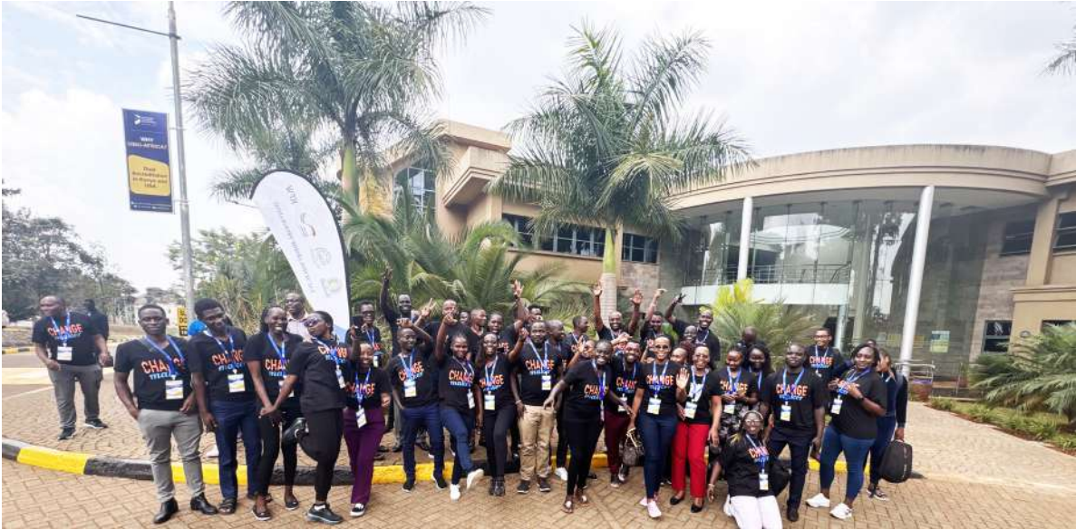
Young East African Scholars under IUCEA-KfW during summer school tour on 17th October 2024 at USIU in Nairobi Kenya.