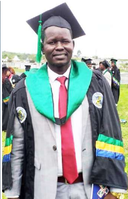
■ EACSP young Scholars after graduation.

Kenya Coast National Polytechnic and the National Institute of Transport in Tanzania have successfully implemented a student exchange programme as part of the East Africa Skills for Transformation and Regional Integration Project (EASTRIP), fostering collaboration among TVET institutes in East Africa.