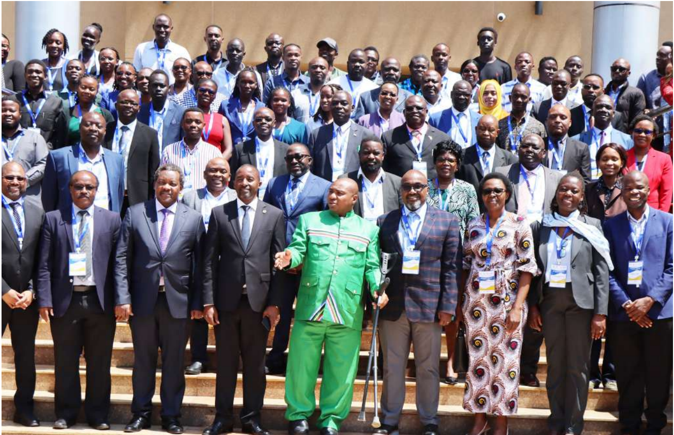
■ Participants and different stakeholders at UISU during the Summer Schol Tour on the 17th of October 2024

The inaugural Summer School for Cohort 3 students, which began on October 17, 2024, concluded at the United States International University Africa (USIU). The program focused on the theme “Free Movement of Workers and Regional Integration: Opportunities and Challenges.” This initiative explored key issues and challenges related to the East African Community (EAC)