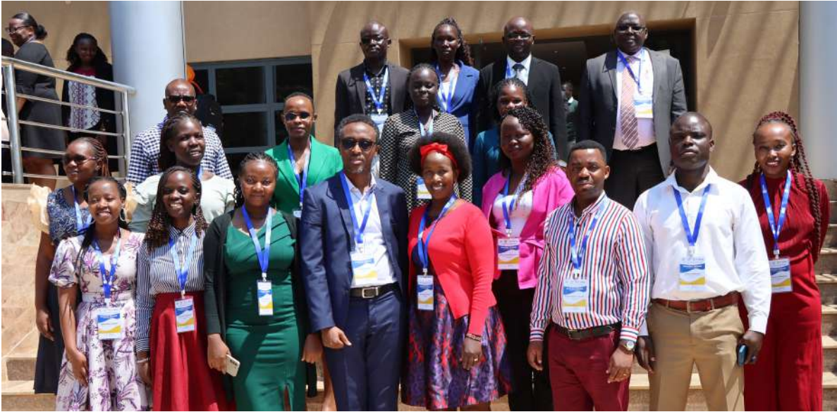
Stakeholders during EACSP Summer School Tour on 17 th October 2024 at USIU