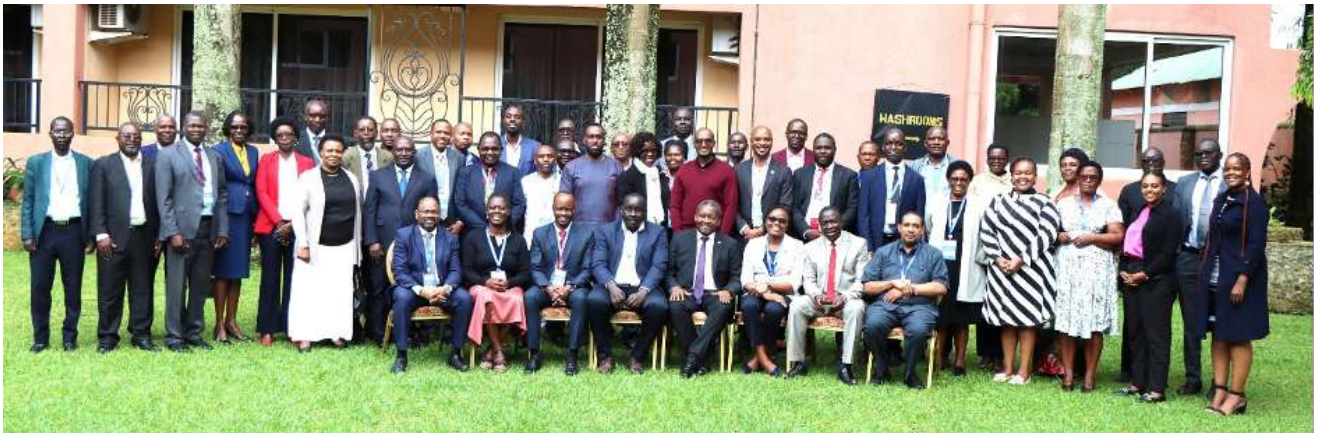
Regional representatives from EAC Partner States, Development Partners and the IUCEA Team in Entebbe on 19th of June 2025.

The workshop on mutual recognition of qualifications in East Africa concluded in Entebbe, Uganda. This workshop started on the 19th of June and concluded on the 20th of June 2025. The workshop has gathered participants from the East African Community (EAC) Partner States of Burundi, the Democratic Republic of the Congo (DRC), Kenya, Rwanda, Tanzania, Somalia, South Sudan, and Uganda.