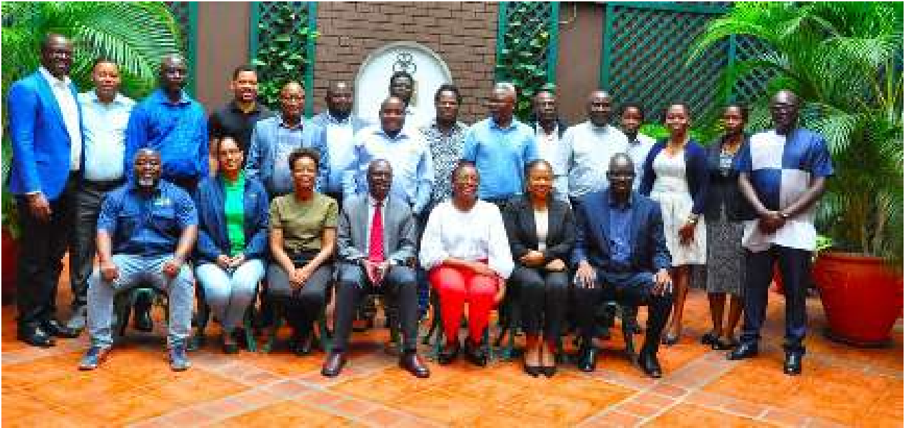
■ Participants from Mozambique, Malawi and IUCEA Staff in Nairobi at Reporting Training on 17th of November 2025

The training for the Eastern and Southern Africa Centres of Excellence on drafting the Implementation Completion and Results (ICR) Report concluded in Nairobi on 21 November 2025. The workshop was organised to fulfil a key World Bank requirement for producing a high-quality ICR report following the completion of the ACE II project.