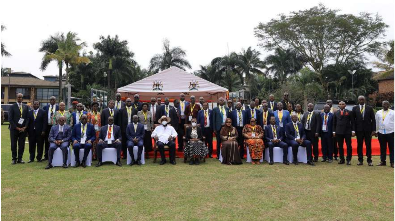
IUCEA staff, NCHC staff, EAC Ministers of Higher Education and President Museveni on the 9th of September 2025 in Munyonyo Resort Hotel

The first East African Community (EAC) Ministerial Conference on the Common Higher Education Area took place at the Munyonyo Resort Hotel in Kampala, Uganda. The conference began on September 9, 2025, and concluded on September 11. It