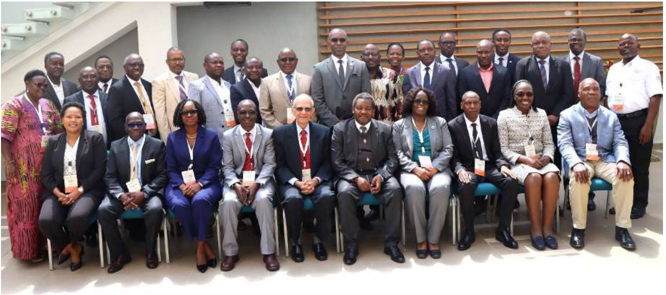
Stakeholders group Photo on the 1st of September 2025 at Radisson Blu Hotel, Nairobi

The leadership training concluded in Nairobi, bringing together Vice Chancellors and center leaders from various centers of excellence across Eastern and Southern Africa. This training took place from September 1 to September 6, 2025.