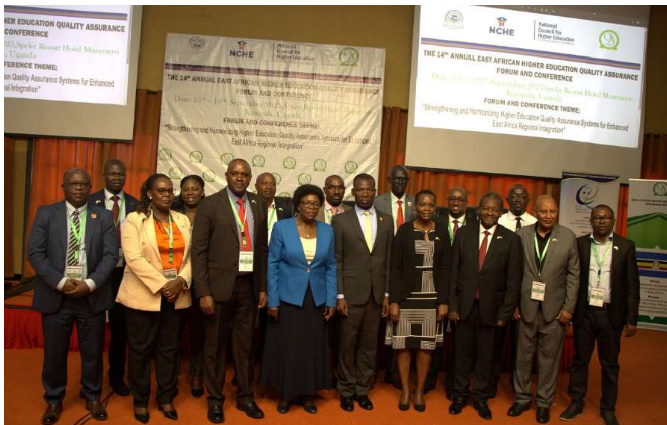
IUCEA, NCHC and EAQAN Representatives at the 14th Forum in Munyonyo Resort on 15th of September 2025

The 14th Annual East African Higher Education Quality Assurance Network conference has officially concluded at Speke Resort Munyonyo. The conference that started on the 15th of September 2025 brought together quality assurance