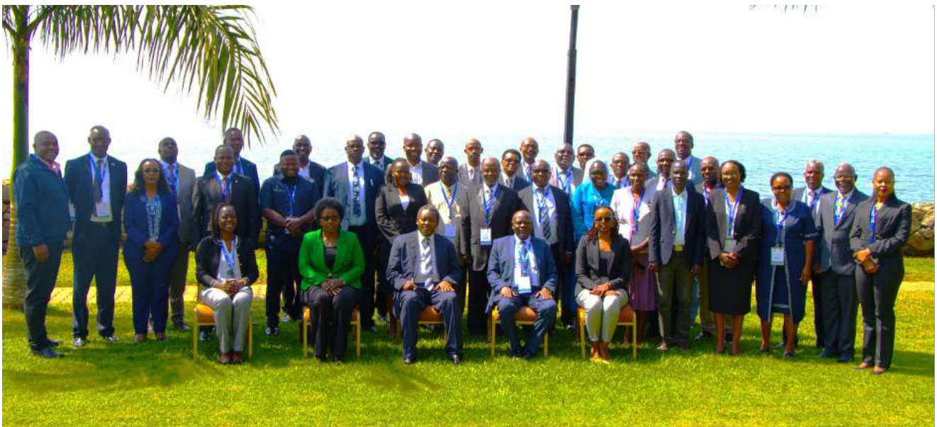
Regional representatives from EAC Partner States, Development Partners and the IUCEA Team in Entebbe on 19th of June 2025.

T he meeting on the East African Scholarship Mobility Scheme (EAC-SMS) concluded at the Protea Hotel in Entebbe on 19th October 2025, gathering Vice