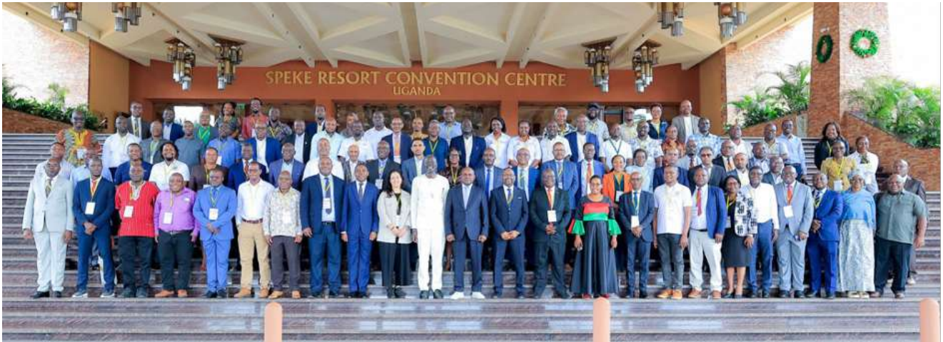
■ Different stakeholders at the ACE II Technical and Advisory Meeting on the 8th of December 2025 in Munyonyo Resort Hotel.