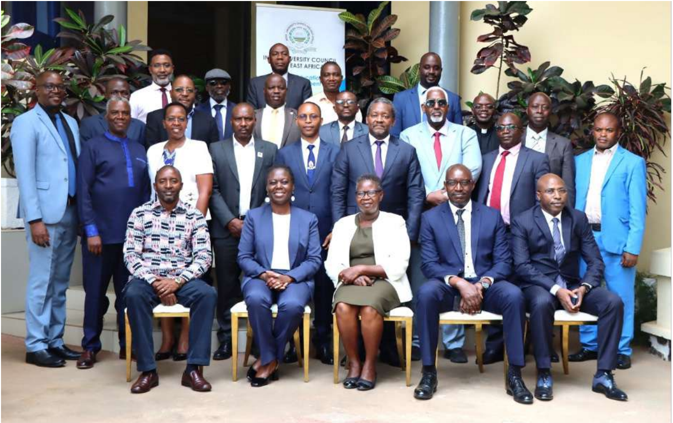
Stakeholders in Bujumbura on the 7th of August 2025

The validation workshop for the fee structure model for higher education institutions in the East African Community (EAC) took place in Bujumbura, Burundi, from August 7 to August 8, 2025. This significant gathering brought together a diverse group of participants representing various stakeholders, including representatives from EAC Partner States, along with distinguished