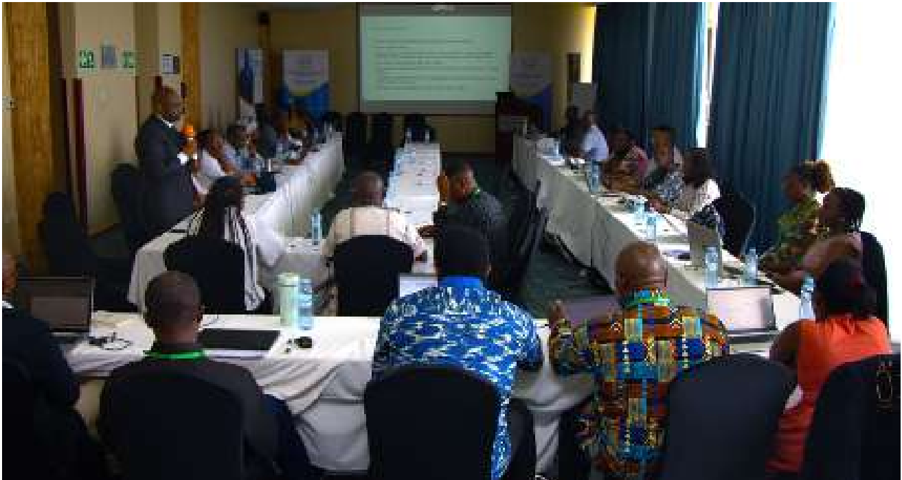
■ Stakeholders' engagement at the Think Tank Workshop in Entebbe on 14th of November 2025

The Stakeholders' Validation Workshop for the Agricultural Policy Think Tank concluded on 14th November 2025 in Entebbe, Uganda, marking a major milestone in advancing evidence-based agricultural policy across the region.