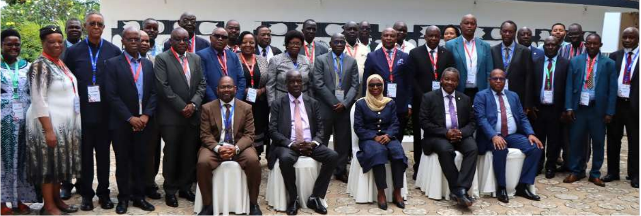
Higher Education Leaders across EAC in Zanzibar on July 2nd of July 2025

The East African Community Higher Education Leadership Training program, organized by the Inter-University Council for East Africa (IUCEA), took place in Zanzibar, Tanzania. This training program ran from July 2nd to July 4th, 2025.