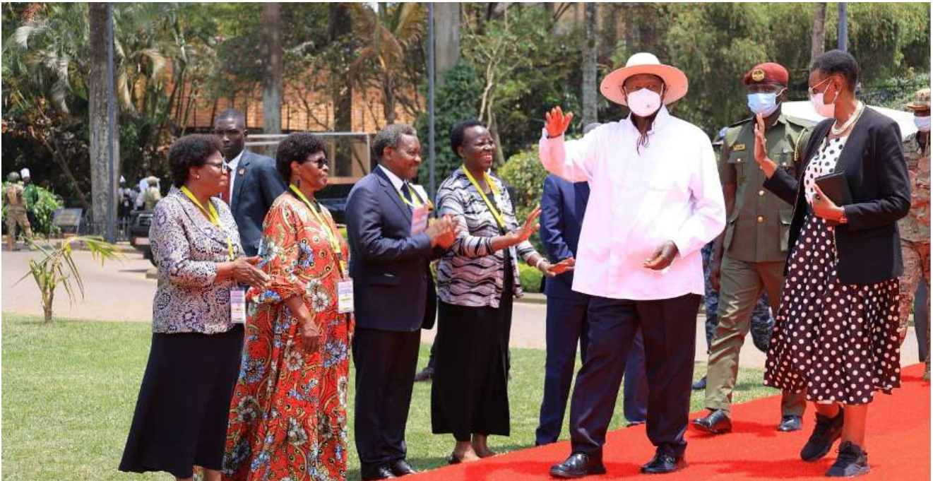
President Museveni and the First Lady and Minister of Education with IUCEA and NCHE leaders in Munyonyo Resort on 9th of September 2025

former Executive Secretary of the Inter-University Council for East Africa (IUCEA), highlighted several key achievements that the Council has realised over the years.