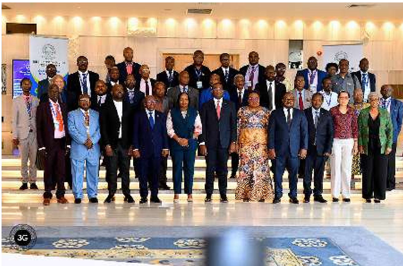
Key Leaders from DRC, EAC Secretary General, Former IUCEA Executive Secretary and IUCEA Executive Committee Members in Kinshasa on 29th of July 2025

The 16th IUCEA Annual Meeting and Conference concluded in Kinshasa, DRC, representing a significant milestone in the development of higher education in the region. The conference took place from July 29th to 30th, 2025, and was attended by a high-level delegation